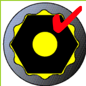
"Draper Expert HI-TORQ" TM