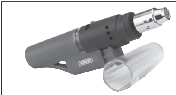
Dual purpose detachable lid/workstand.