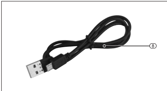
⑧ Micro USB cable.

As well as the worklight; there are separate parts not fitted or attached to it.