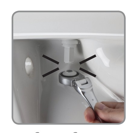
Snap to Secure