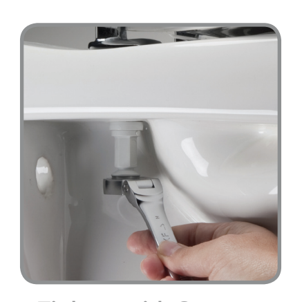
Tighten with Spanner