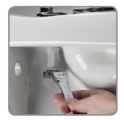
Tighten with Spanner