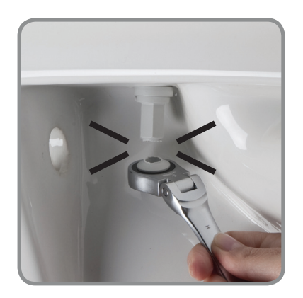
Snap to Secure