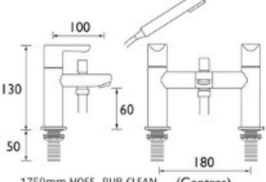
1750mm HOSE, RUB CLEAN (Centres) HANDSET & WALL BRACKET