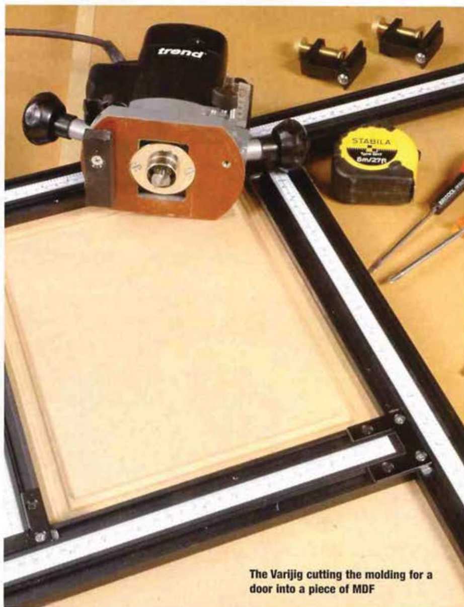
The Varijig cutting the molding for a door into a piece of MDF

The router is guided around the jig either by using a template guide, a bearing-guided bit or the edge of the base. This is easier if the base is round. For routers that have a base that is smaller than 6", a Trend Unibase can be fitted. Centering the Unibase on the router will mean that it can be used to guide the router around the confines of the Varijig, regardless of its orientation. This is an ideal way of cutting grooves and the like. Due to the large offset required, this