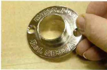
A 1 1/2" outside-diameter template guide is recommended. This one has a longer spigot than the standard model