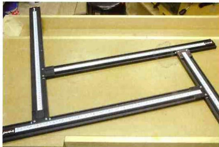
The jig can be configured in many ways