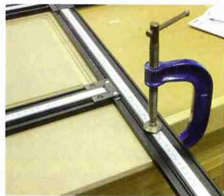
Clamping the jig in place using conventional clamps

is of similar height to that of the Varijig's rails. The block has a countersunk hole in it and is supplied with an M6 screw. This will fit the threaded mounting holes on all Trend routers and lots of other makes too. The block may be a bit big for smaller jobs and could be cut down, although a better course of action would be to make a smaller hardwood block, of similar thickness and use it when the larger block becomes too cumbersome. Profiling bits with shank-mounted bearings can also be used with the jig,