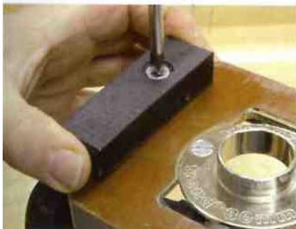
The anti-tilt block and screw supplied with the Varijig