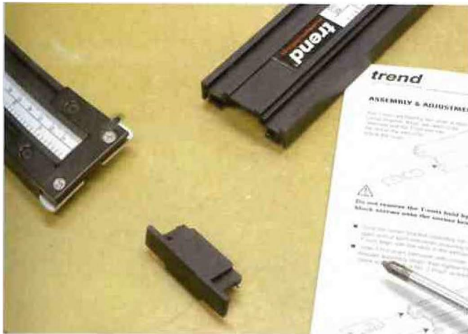
Assembly is simple; all the parts go together easily