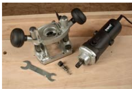
Motor removed for copy work

Everything worked well, and all adjustments and controls were smooth. The motor picked up speed slowly but smoothly and was quite