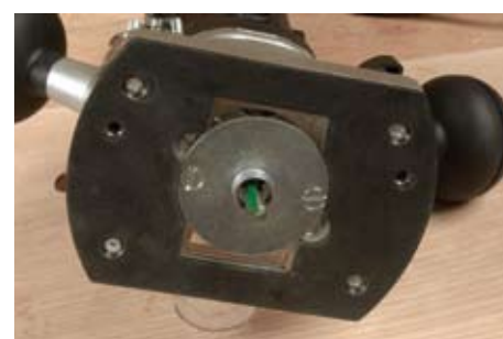
Note how closed the fixing holes are

It is a good substitute for the old lamented Bosch POF routers. The T4E should prove to be a worthy successor in the lightweight category. F&C