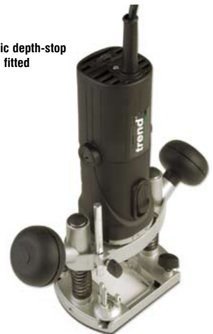
A basic depth-stop rod is fitted

T rend has introduced a smaller router to their black and silver range. Touted as a 'copy router', the T4E fills a gap at the lower end. Bosch used to sell small 'green' router models which were great for smaller work, and many professionals used them as a machining head in a copy router set-up. Trend appears to be exploiting the fact that Bosch has dropped them in favour of bigger machines. The T4E even has a Euroneck collar allowing it to slip easily into existing copy set-ups. The big question is: does it live up to being