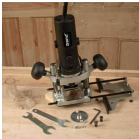
The complete kit

'bright' – you'll need ear defenders. There was a bit of vibration at the cutter end, not perhaps helped by the short collet. However there was plenty of power under load and very smooth cuts resulted. The narrow cutter made holding the base for router-carving work easy.