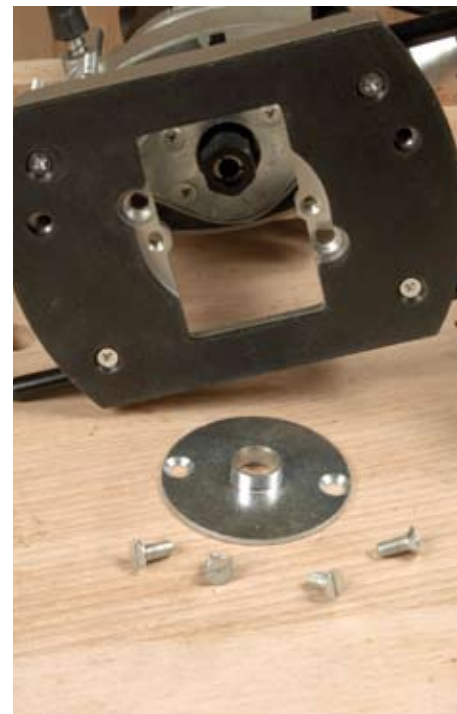
The guidebush is a Trend standard fitting

“The big question is: does it live up to being used as a professional lightweight machine?”