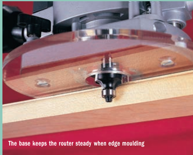
The base keeps the router steady when edge moulding