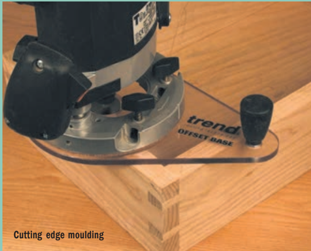
Cutting edge moulding

This base is intended to prevent the router tipping when cutting edge mouldings and rebates using a self guiding (bearing guided) cutter. Fitted to any router having similar mounting points to the Trend T5 and T9 routers, the offset handle allows the router to be balanced and controlled more easily. Price £19.95