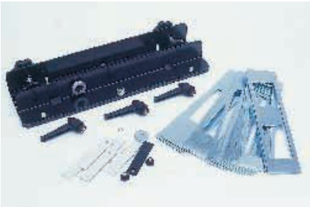
The jig contains a wide selection of templates to suit a range of locks.