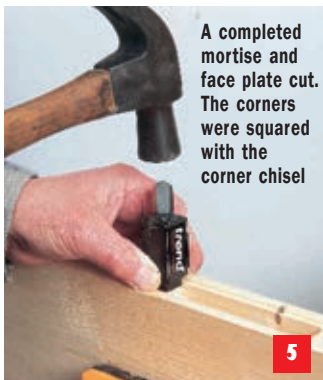
A completed mortise and face plate cut. The corners were squared with the corner chisel

The faceplate recess is then routed in one pass made in a clockwise direction around the template. The corners of the recess will have to be squared with a chisel before fitting the