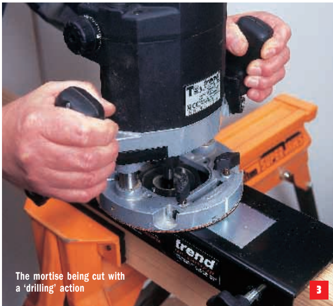
The mortise being cut with a 'drilling' action