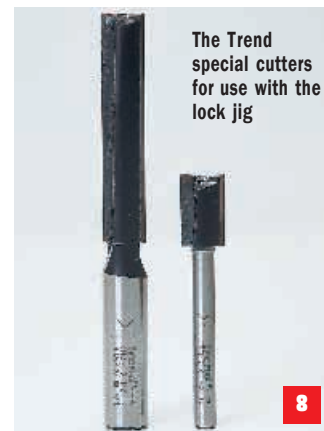
The Trend special cutters for use with the lock jig