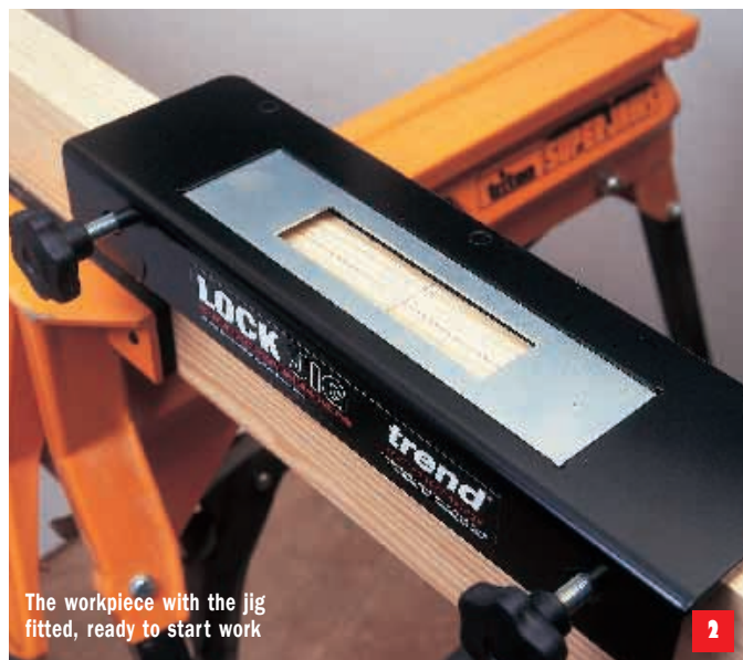
The workpiece with the jig fitted, ready to start work

The mortise is plunge-routed by 'drilling' a series of holes, removing the waste with an extractor, then running round the edge of the template in a