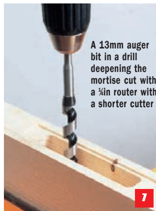
A 13mm auger bit in a drill deepening the mortise cut with a 1/2in router with a shorter cutter