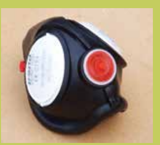
The rubber inner mask incorporates a pair of replaceable filters, plus a downward-facing non-return valve