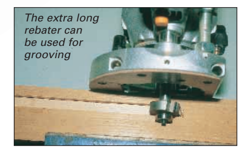
May 2001 WWW.GETWOODWORKING.COM 73

Trend Machinery and Cutting Tools Ltd, tel: 01923 224657, fax: 01923 236879, email: mailsaver@trendm,co.uk, website: www.trendm.co.uk