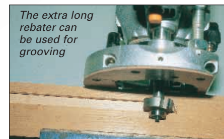
The extra long rebater can be used for grooving