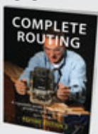
Product Ref. BOOK/CR

An essential read for all router users. Written by Alan Holtham. See page 182 for full details.