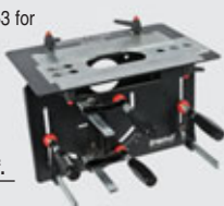
Product Ref. MT/JIG