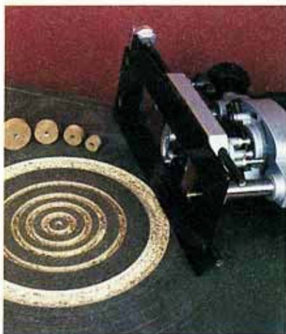
A very versatile jig

To use the N-Compass a 6.35mm ( \frac{1}{4} in) hole is drilled in the work surface for the pivot pin to fit into and the router rotated around this point.