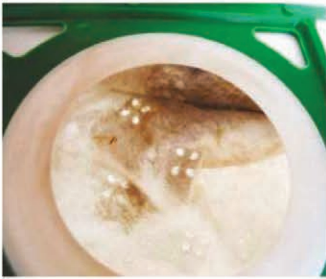
A few seconds of vacuuming and look at the state of the bag