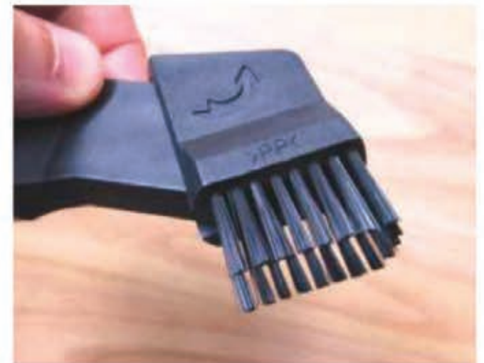
The flip out brush doesn't always stay in place

To test dust control (extraction), I plugged it on to a planer using the adaptor, which stayed in place for the whole length of the wood (2.4m) and removed all shavings – nothing obvious was left behind. Trend point out that the T32 is a vacuum cleaner and not rated as an extractor, even though there's a photo of it being connected to a track saw on the box. You must wear an FFP3 mask too. Bags also fill up very quickly when you extract, so if you really insist on using it frequently