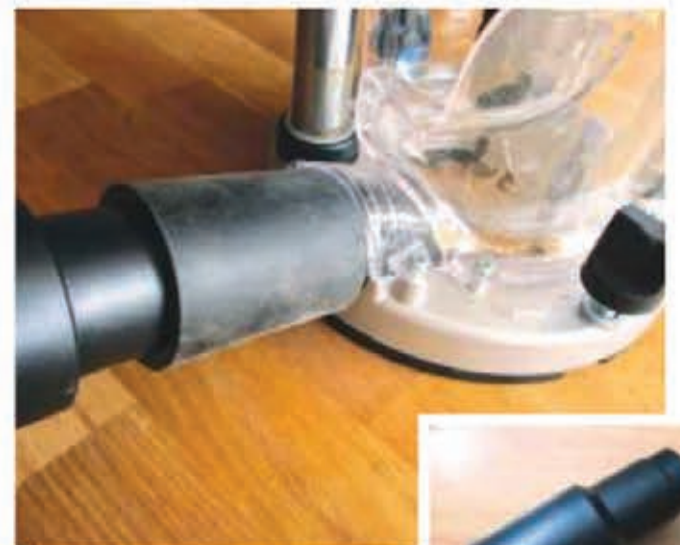
... and also fits a router shroud