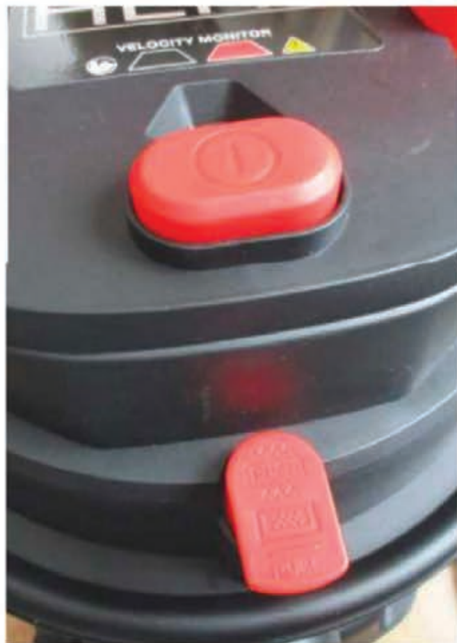
Large on-off button and push-pull filter cleaner

Beware of those bargains, though! What are their filter ratings? Will you even be able to buy replacements in a year's time? It's difficult to spot the good from the bad without experience. Filters that fall off during cleaning, poorly fitting seals that allow dust to escape, bagless containers that redistribute dust as you empty them over the dustbin – even if it isn't windy – shut the lid, quick!