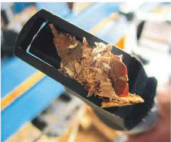
The crevice tool can get blocked with bigger chips

The 800W motor is powerful but quiet: at 80dB, it's on the hearing-protection-required threshold for average daily noise exposure, so if you use it for long periods, in small spaces or