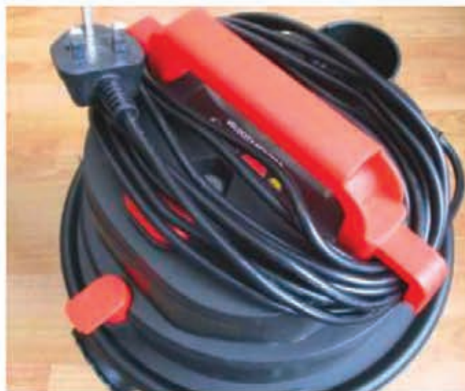
The 5m cable can be stored on top

The T32 is M-rated, compact, light, manoeuvrable and looks suitably professional. The vacuum unit in the lid clips onto the steel collection container securely and seals tightly. The big red power button is easy to push for on and off, the flow indicator above this shows when air isn't getting through or the bag is filling up; there's a push-pull