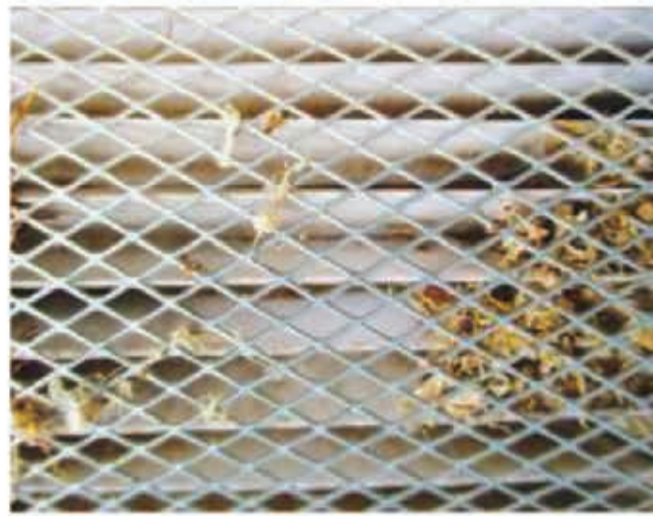
... but the HEPA filter will soon be blocked