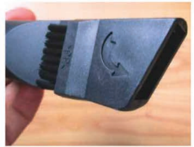
A crevice tool is supplied for small spaces

button to clear the HEPA filter surface. The generous 3m tube and 5m cable provide plenty of reach and the tapered, flexible dust spout adaptor attaches to the hose so that it can be fitted to ports on power tools for 'dust control' purposes.