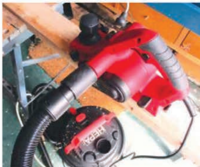
A flexible dust spout adaptor provides dust control on a planer...