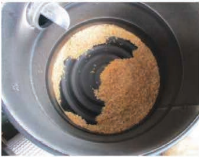
You can use the vacuum bagless...