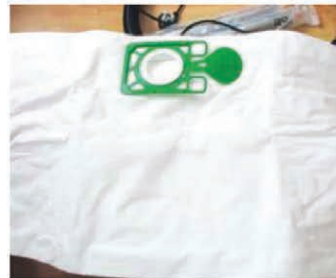
The 15 litre bag has plenty of collection potential