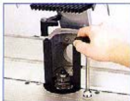
Adjustments to cutter height are quick and easy