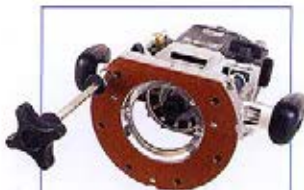
The Quick Raiser can be used from above or through the base of the router