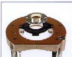
An adjustable inner plate ensures that subsequent guidebush fittings are accurate

This rather familiar looking heavyweight is simply a T11 without the fancy base – in other words a DeWalt 625E in disguise. However, the T10 also has the Inner Plate Centring Ring (that aids the exact centring of guidebushes), and a pair of extra-long guide rods. The huge 80mm plunge is also a real boon.