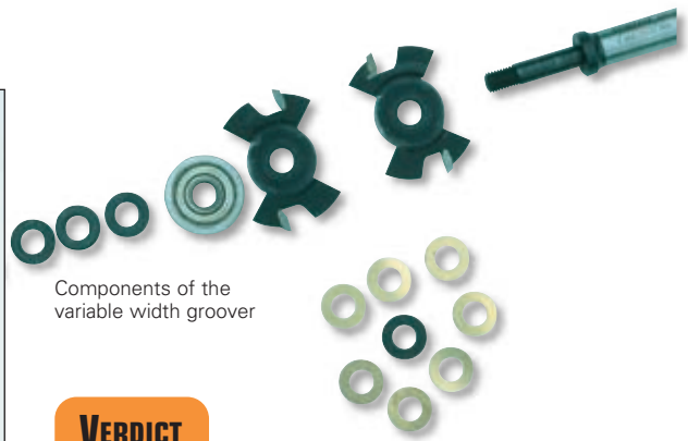
Components of the variable width groover

Two patterns are available, an ovolo profile, and a round-over one. The PSC/106 cutter set has a 10mm round-over mould, while the PSC107 has a 6.35mm radius ovolo. Both cutters are