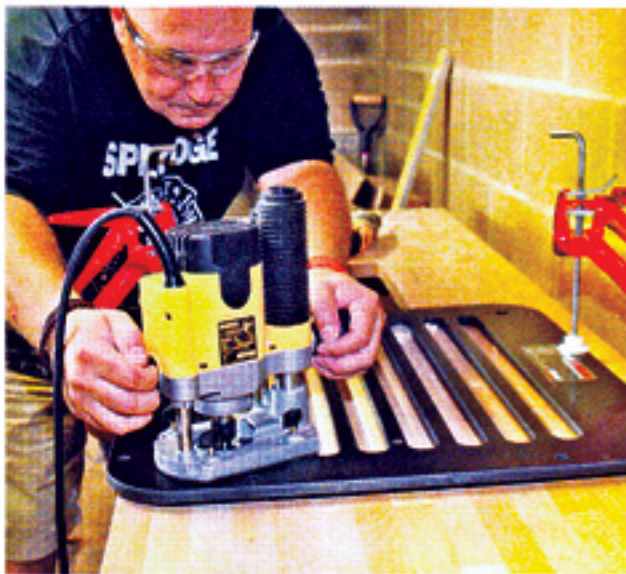
▲ Make each pass through the jig until they are all routed