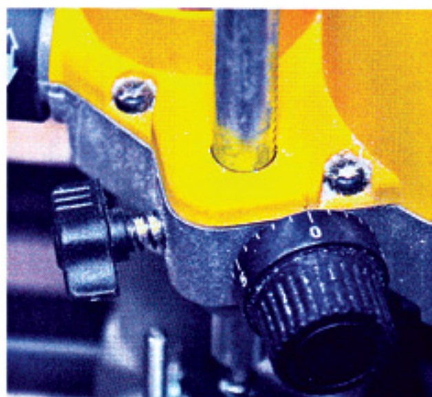
▲ Set the depth by plunging the cutter and zeroing...