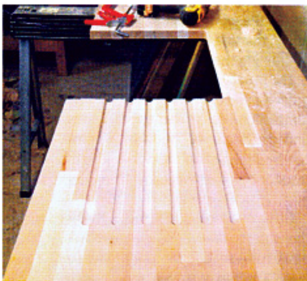
▲ The grooves are clean and consistent with a slight fall