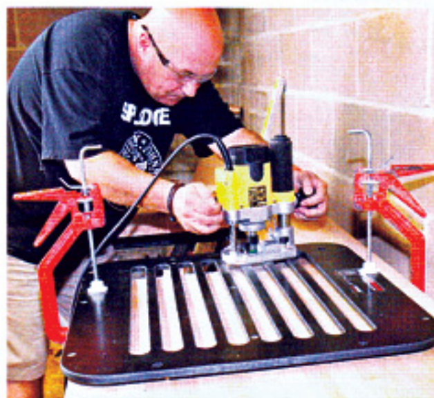
▲ Starting at the innermost slot helps eliminate mistakes