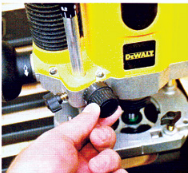
▲ ...then back off the plunge post to the correct cutting depth