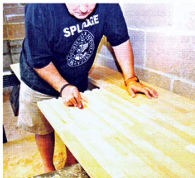
▲ A bit of light sanding and it's ready for fitting and finishing