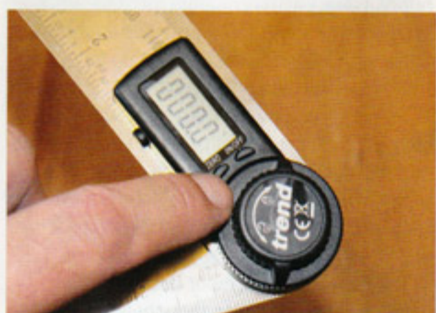
▲ You can zero the setting at any angle if needed