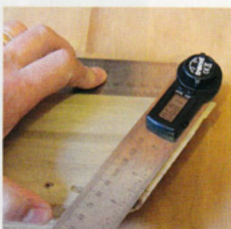
▲ ...and then the other to set the saw accordingly