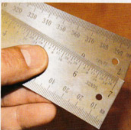
▲ The stainless-steel blades have clear metric and imperial etchings