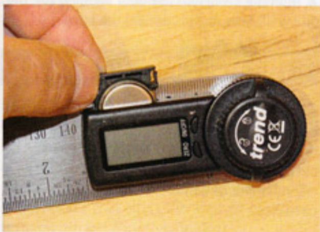
▲ The battery is easily replaceable when required