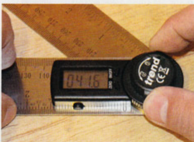
▲ The lock could do with being slightly tighter