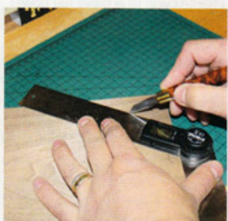
▲ Inlay and suchlike work well with the ruler