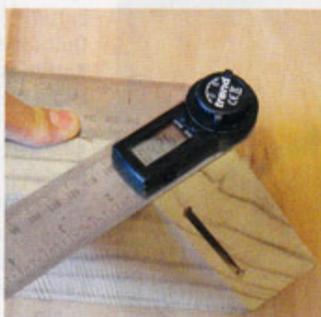
▲ Compound angles can be checked and replicated by taking one angle...