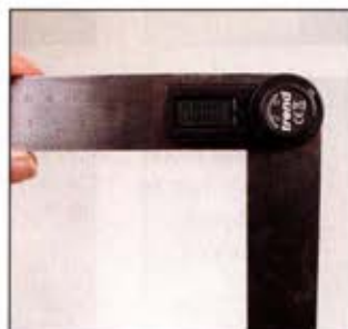
...and also when the blades are at any other angle