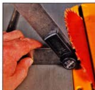
Setting the tilt angle on a table saw