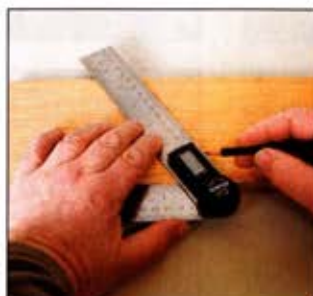
The sliding bevel is now redundant for many jobs