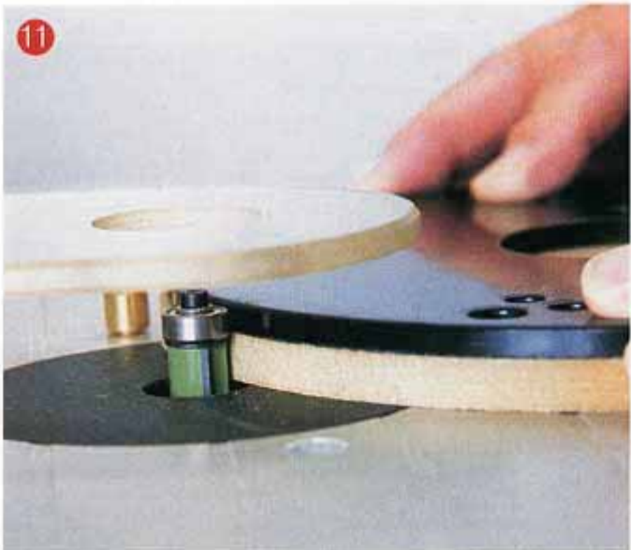
A base pattern in MDF being made for the Bosch 2000 router

made by machining the edges of a small board and parting off the moulding. A simple auxiliary fence is taped to the table fence with an aperture cut to match the cutter being used. Several lengths of completed moulding can be seen in the foreground.