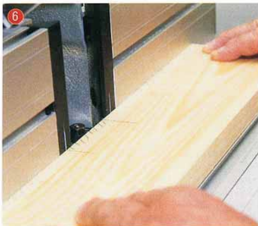
A board being slotted for biscuit jointing. Note the white vertical lines on the black plastic fence trim, to mark the limits of the cut