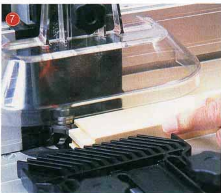
A scribed door rail being profiled to take the edge of the panel