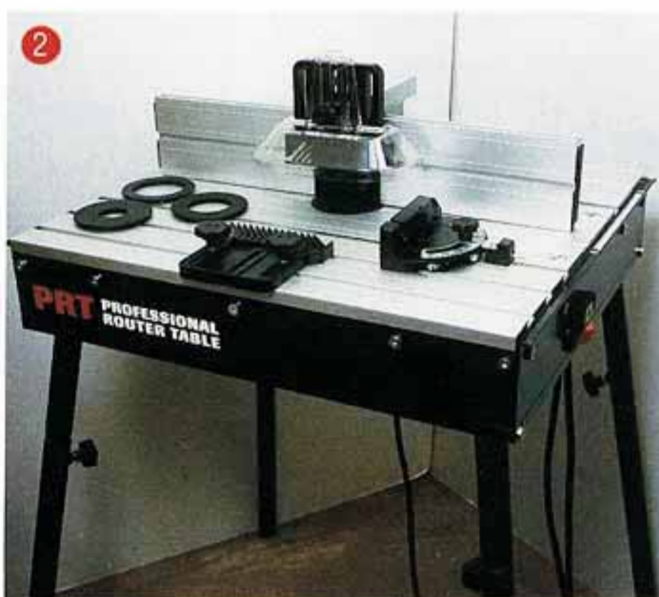
The fully equipped table

Photo 2 shows the fully equipped table as supplied, with all the guards, mitre fence, reducing rings and NVR switch.