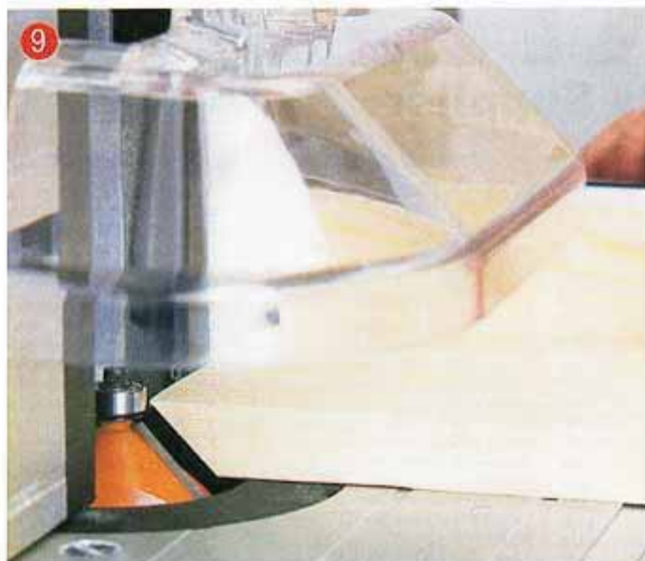
The ends of a box component being milled