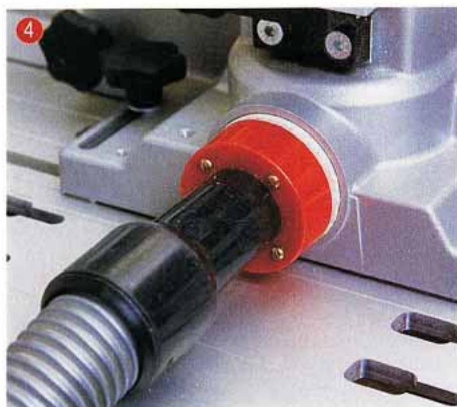
The dust extractor connected with a home-made adaptor