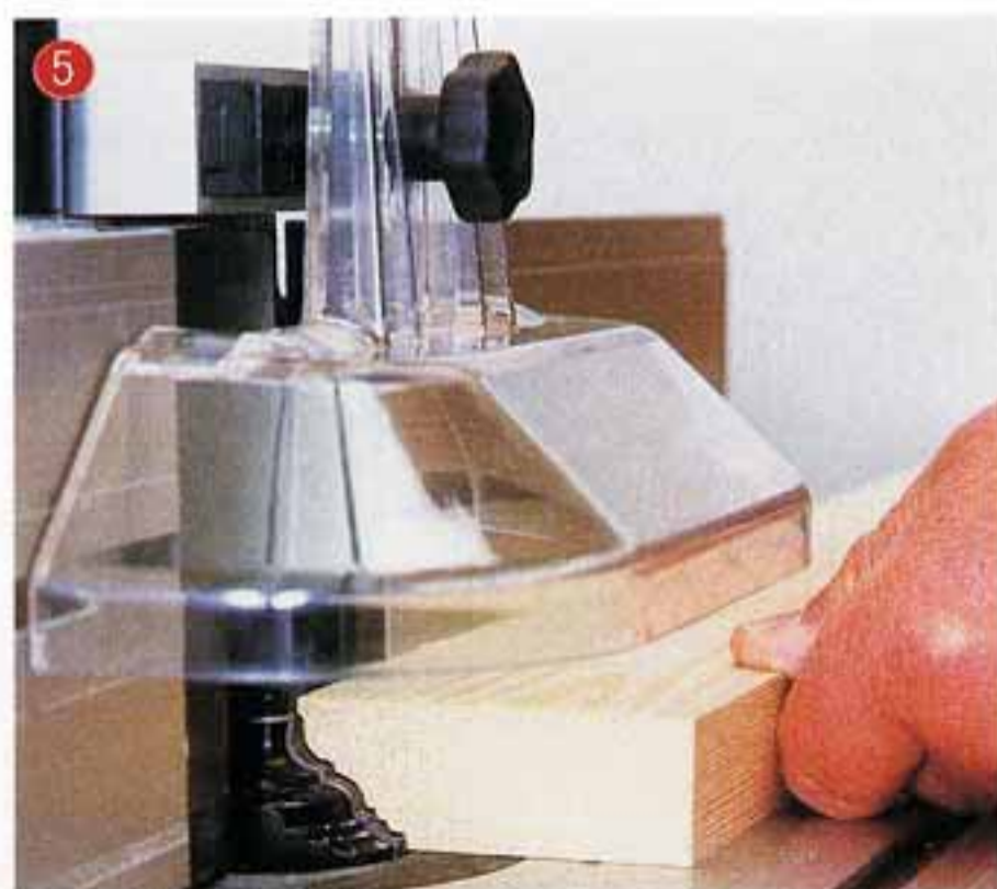
The edge of a board being moulded as part of a built-up compound moulding