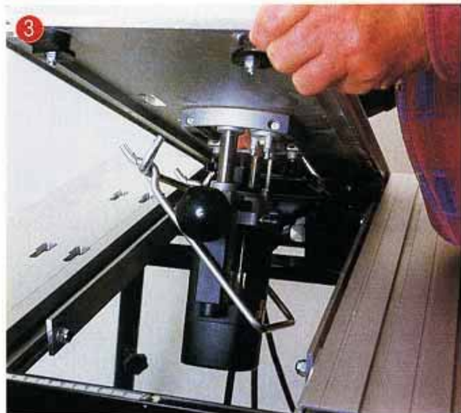
The T5 router complete with PlungeBar being lowered into the table