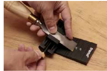
▲ You slide the blade through until it rests against the ridge of the required hone angle