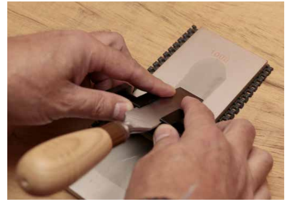
▲ The wide roller on the guide keeps things very stable as you work on the stone