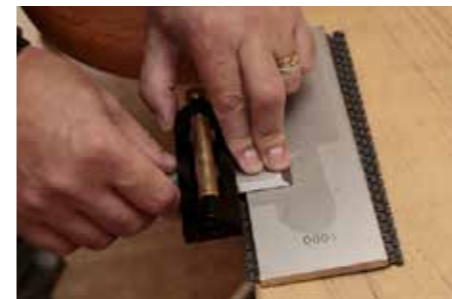
▲ Blade projection is sufficient to allow easy backing off while still in the guide