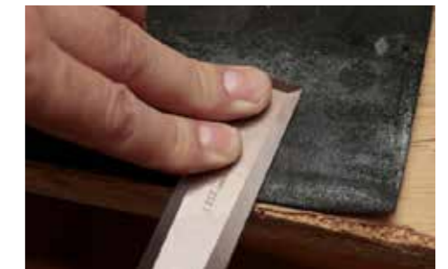
▲ It does work well enough but the leather is best bonded to a board

to the correct position as it is tightened. This method of gripping the blades may be slightly limiting for some as it means that only dovetail chisels, plane irons or blades with a thickness of less than 7mm will slide under the shoulders to secure them, but that should cover most general day-to-day tools. The overall width capacity is 58mm, so unless you own a No.8 jointer with a 2 7/8in blade, it covers a wide range.