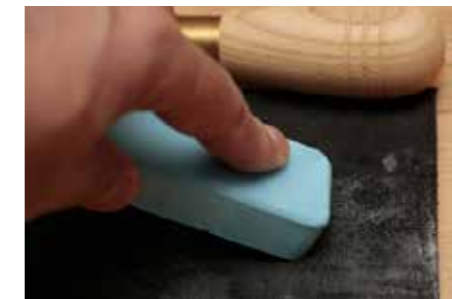
▲ The honing compound is quite hard and chalky when applying to the leather