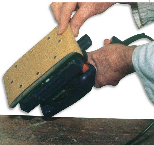
Standard perforated abrasive sheets are attached to the VX150 orbital sander using the basic clip system

The sliding on-off switch at the front of the body is conveniently positioned for operating with the forefinger, but is a little on the stiff side.