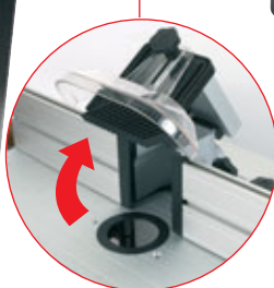
Flip-up finger pressure and guard assembly For easy access to cutter.