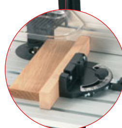
Mitre fence Mitre fence with zeroing and splch block facility.