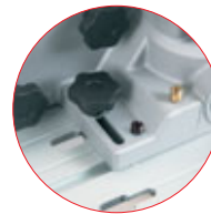
Backfence Quick release 110mm cast aluminium backfence with adjustable aluminium cheeks and squareness adjustment.