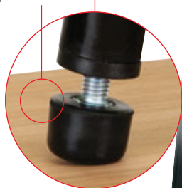
Bench leg level adjustment For uneven surfaces.