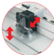
Guard assembly Quick lateral and height adjustment of finger pressure and guard.