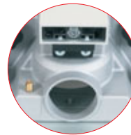
57mmØ (2-1/4") dust spout aperture With freehand lead-on pin park.