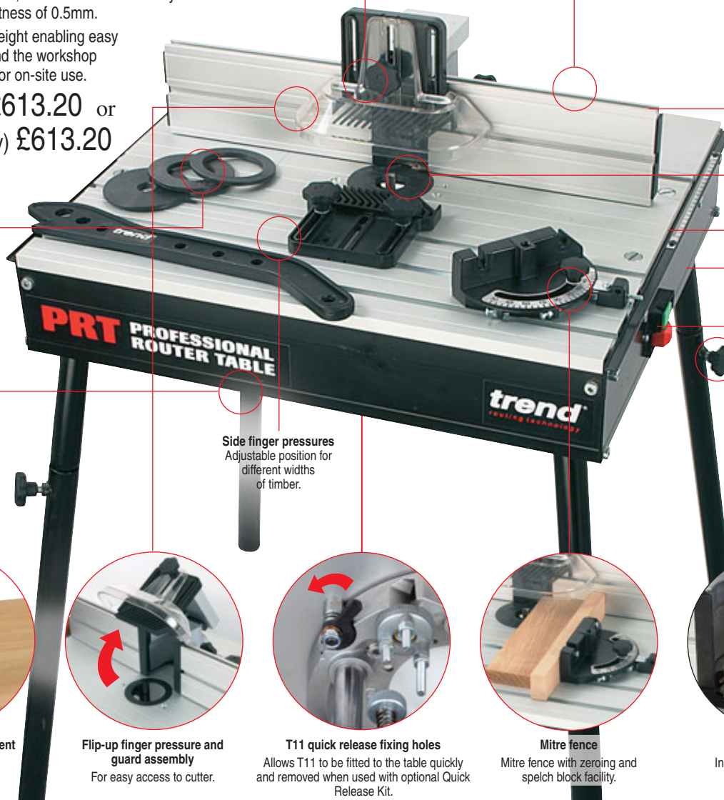
90mmØ aperture For larger panel raiser cutters.