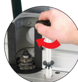
Quick raiser Includes hole for T11's fine height adjuster.