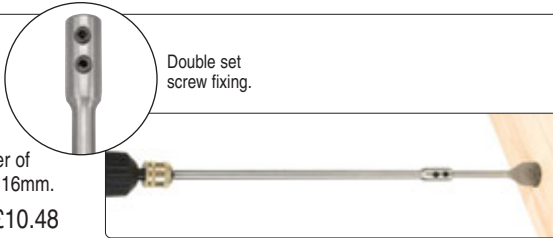
Double set screw fixing.