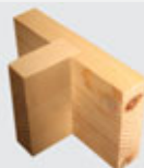
Through housing joint using tenon slide template.