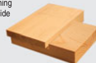
Half lap (halving) joint using tenon slide template.