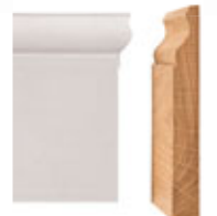
Scribes differing skirting boards.