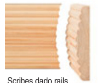
Scribes dado rails.