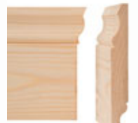
Scribes skirting boards.