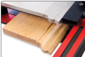
Close-up of cut.