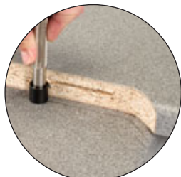
Worktop scribing facility.