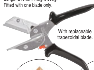
With replaceable trapezoidal blade.

Length 210mm, weight 380g. Fitted with one blade only.