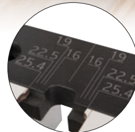
Engraved on top for lock width & on underside to allow set-up for 35mm, 40mm, 44mm & 54mm door widths.