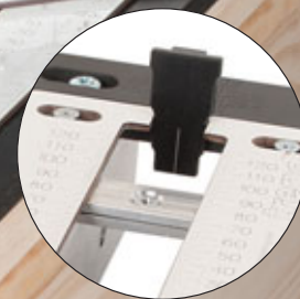
Setting gauge for doors to centre jig & set widths.

Certain makes and models of router will require a Unibase to accept the guide bushes.