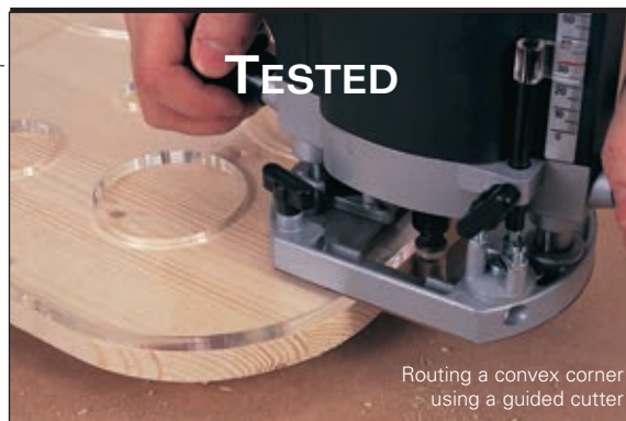
Routing a convex corner using a guided cutter

Amongst the new items to be featured in Trend's latest routing catalogue are a number of templates in tough, clear PETG plastic. One of these is for use when forming rounded corners as well as holes and circular recesses. This template measures 290mm x 290mm and is 8mm thick.