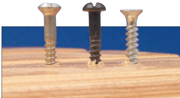
Head shapes — raised, round and countersunk