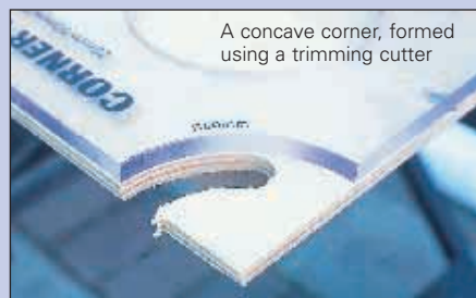
A concave corner, formed using a trimming cutter

I found this template worked well and with the minimum of familiarisation.