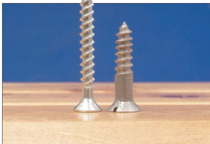
Screw threads — double helix and single thread

These are especially suitable for softer timbers and for securing sheet materials. Some double helix threads have extra sharp or deep threads and maybe specially lubricated for ease of insertion.