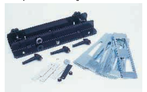
Cutting the mortice