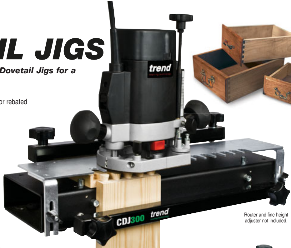
Router and fine height adjuster not included.