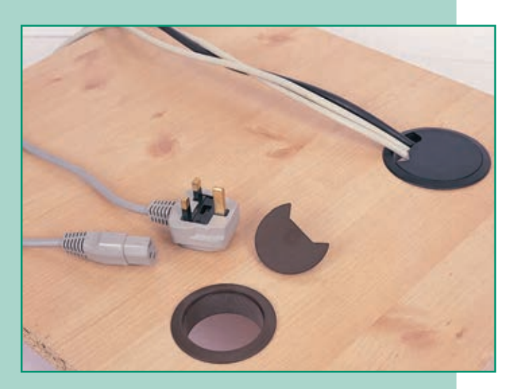
Trend also supply a range of plastic cable tidys and inserts in several different colours

Standard size cable tidy inserts, in brown, grey or black, are available from various manufacturers or (at £4.95, £5.95 or £6.95 per pack of 3) from Trend.