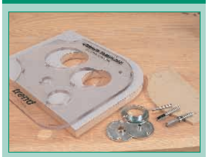
The corner and hole template can be used not only for rounding corners and cutting infinite diameter holes, but for producing accurate, square edged curved templates

This template is intended for cutting concave and convex curves as well as holes, making it ideal as a master template for producing precision curved and compound curved working templates. It can also be used for rounding corners on panels, table tops and worktops, as well as for cutting holes for finger pulls, inserts, ironmongery and other decorative features.