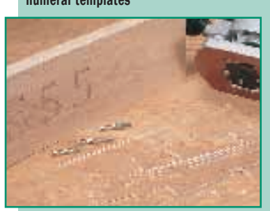
Both numeral and alphabet templates can be used with alternative cutters to produce rounded, moulded or Vee cut lines, all using the same diameter (13mm) guide bush.

With a nominal letter height of 57mm, these templates are intended for producing name boards and directional signs for both commercial and domestic applications. Available as a set of three letter templates or two numeral templates, they are intended for use with a 13mm guide bush and straight flute 8mm cutter (available together as an optional extra: Set Temp/LN57x1/4 @ £9.95 ex vat).