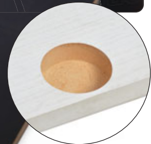
Cuts circular hinge holes 26mmØ & 35mmØ