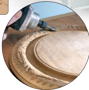
Removable base for shaping & sharpening. Use Burrs & Rasps for grinding & carving, see page 78 for full details.