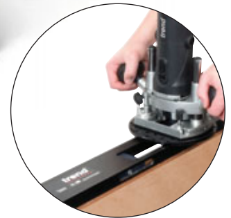
Hinge recessing with a Hinge Jig & Unibase fitted or use Ref. GB/T4/160.