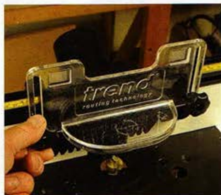
The clear plastic guard and the spring fingers co-locate on the same bolts, so a little juggling is required to set both

someone has given this table quite a lot of thought and there is great attention to the detail.