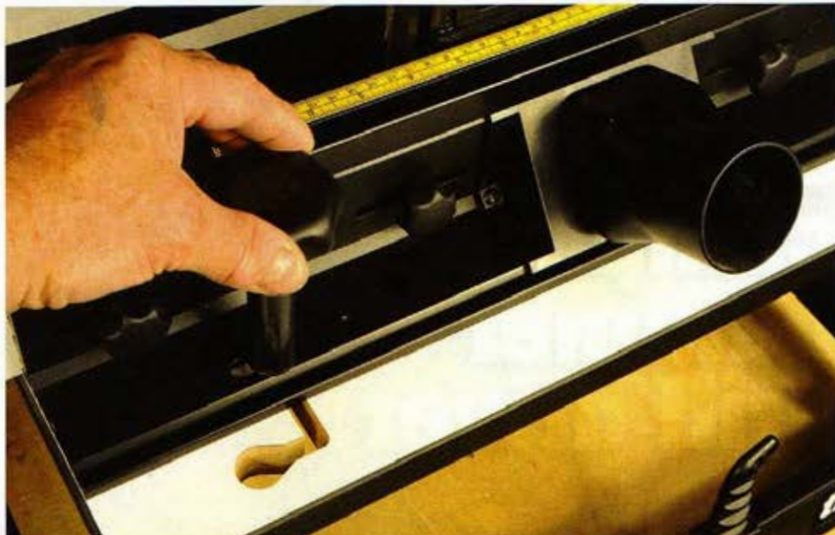
Once the lock knobs are undone, slide the fence backwards and off to the side, then you can lift the fence clear of the table for table routing with the lead-in pin only

However, there are many little design touches which suggest