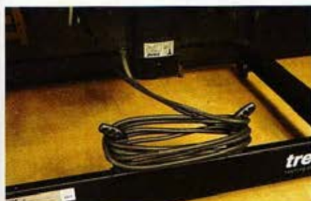
A neat idea that gets rid of the problem of surplus flex hanging down