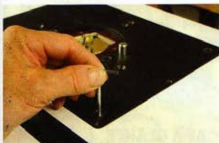
One Allen key is used to make the quite subtle adjustments when levelling the insert – you can re-level it at any time