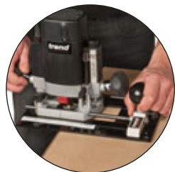
Offset base For better control when edge routing.