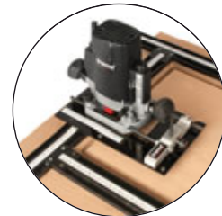
Varijig frame system Anti-tilt facility for panel cutting when used with the Varijig with accessory guide bush Ref. GB40/B.