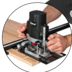
Clamp guide adjustable grooving With 40mm micro adjustment.