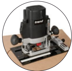
Router compass For routing circles of 19mm to 224mm radius.