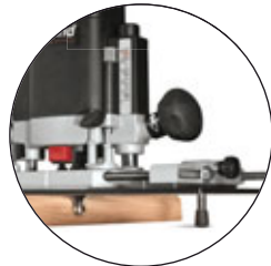
Anti-tilt support For stable edge work. Height range 8mm to 80mm.