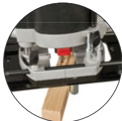
Offset mortising For timber thickness 50mm to 200mm.