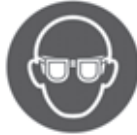
Wear eye protection