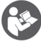
Refer to instruction manual

IMPORTANT: PLEASE READ THESE INSTRUCTIONS CAREFULLY. NOTE THE SAFE OPERATIONAL REQUIREMENTS, WARNINGS & CAUTIONS. USE THE PRODUCT CORRECTLY AND WITH CARE FOR THE PURPOSE FOR WHICH IT IS INTENDED. FAILURE TO DO SO MAY CAUSE DAMAGE AND/OR PERSONAL INJURY AND WILL INVALIDATE THE WARRANTY. KEEP THESE INSTRUCTIONS SAFE FOR FUTURE USE.