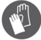
Wear protective gloves