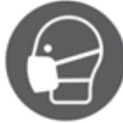
Wear face mask