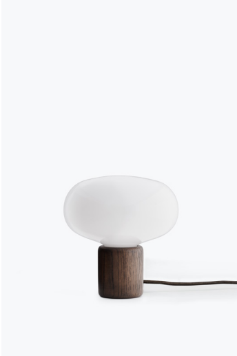
Smoked Oak w. White Opal Glass